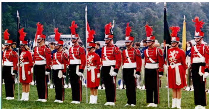
1967: Boston Crusaders

This scorecard shows some amazing things, in light of recent events. First, it was no surprise that Boston won. They had been the talk of the Drum Corps World and had reached "Super Corpsdom". Nor was it any surprise that Chicago was in second place, though they were not often in that position. St. Joseph's, backing up rumours of greatness, were only two points out of second.