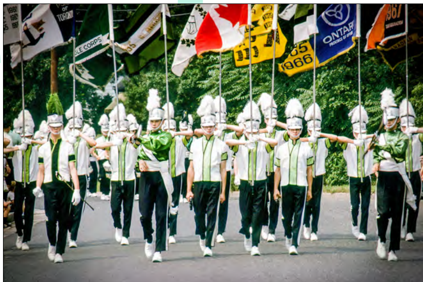
1967: Toronto Optimists Guard in summer uniforms with rifles in regular uniform

On August 29 was the 4th Annual C.Y.O. Invitational Championship. The Optimists had been at this one a few times before, because they were the