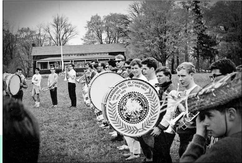
1966: Toronto Optimists at pre-season camp

The Optimists were still and, once again, the Canadian champions. They had been challenged and had overcome their challenges. The major difference between now and the past was that, from now on, the challenges would increase, not fade. This result also set the agenda for the coming year – to win number ten and make it ten in a row. This, if it could be done, would surpass any record held by an American Corps.