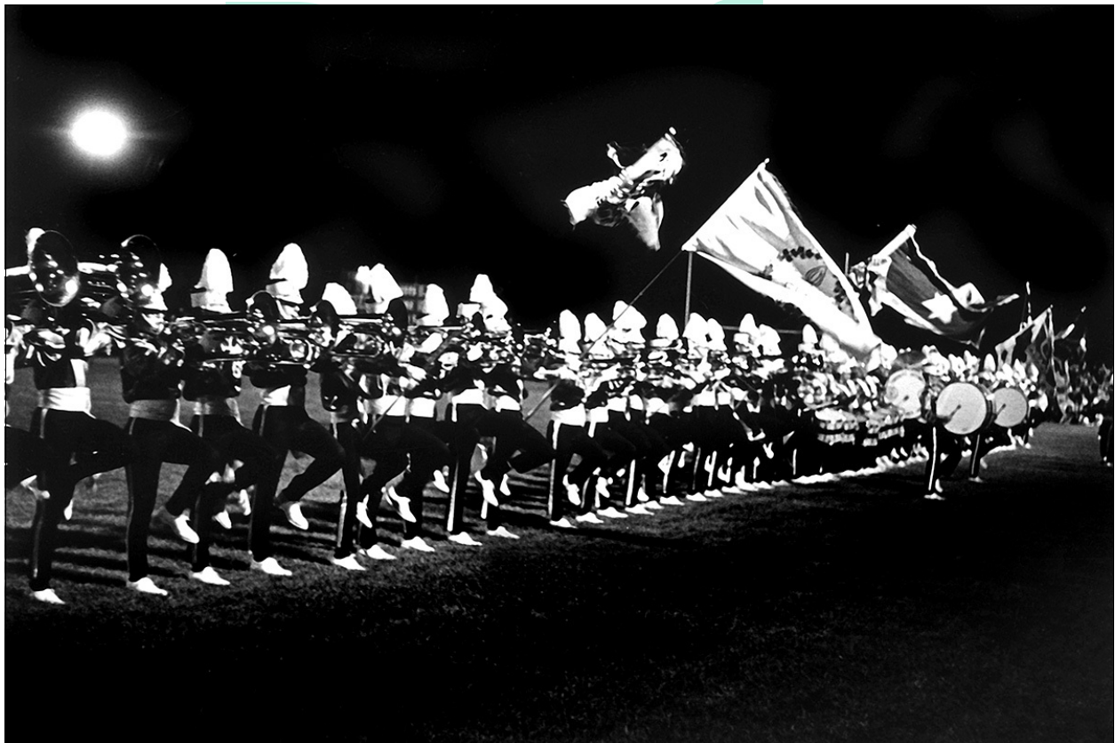
1967: Toronto Optimists in a company front

For the Optimists this was even more important than usual. If they could win this one, it would be the tenth consecutive National title. It was also the tenth anniversary of the winning of their first National title, in 1958. About the only Corps remaining from those days was De La Salle. Scout House was still around but were not competing. Finally, of course, the number ten has certain significance in our culture, as does seven, twelve, or thirteen. Ten is a sort of milestone used to gauge many things. If this was a milestone, of sorts, another was that this would be the most hotly contested Junior Championship in Canadian Drum Corps history. There were four genuine contenders for first place.