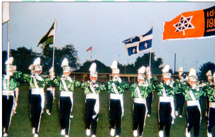
1967: Toronto Optimists (Sarnia)

Next, in the U.S., for the Optimists, was the first "A Junior C" Championships. The Corps really wanted this one and came off in high gear, but it was not to be. The New York State powerhouse, St. Joseph's of Batavia won it, Magnificent Yankees were second with the Optimists, four points back, in third place. Only weeks earlier they had been closer than that to the Chicago Cavaliers.