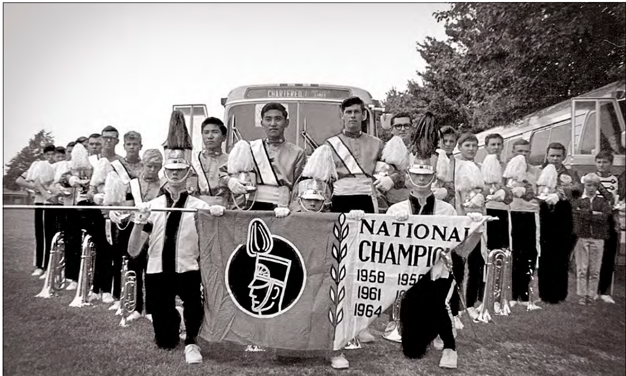
1967: Siblings in the corps