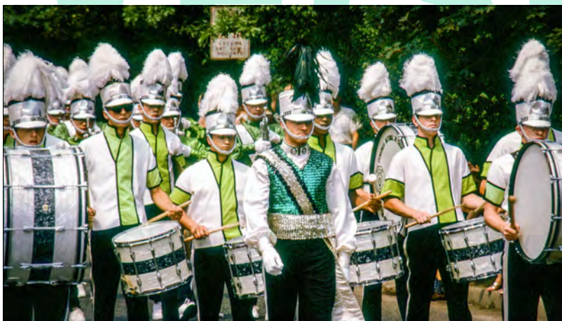
1967: Toronto Optimists in summer parade uniforms