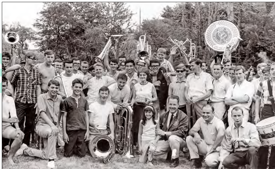
1966: Toronto Optimists (Kingston, NY)

La Salle Cadets, still not yet great in Canada, had gone to the World Open Contest in the United States. They had won eighth place in the preliminaries and seventh in the finals. This result was a sign of things to come.