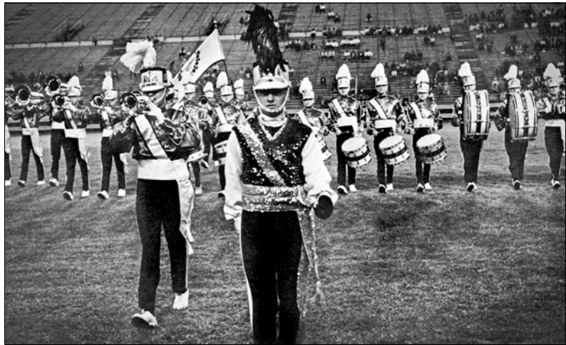
1966: Toronto Optimists (Shriners International)