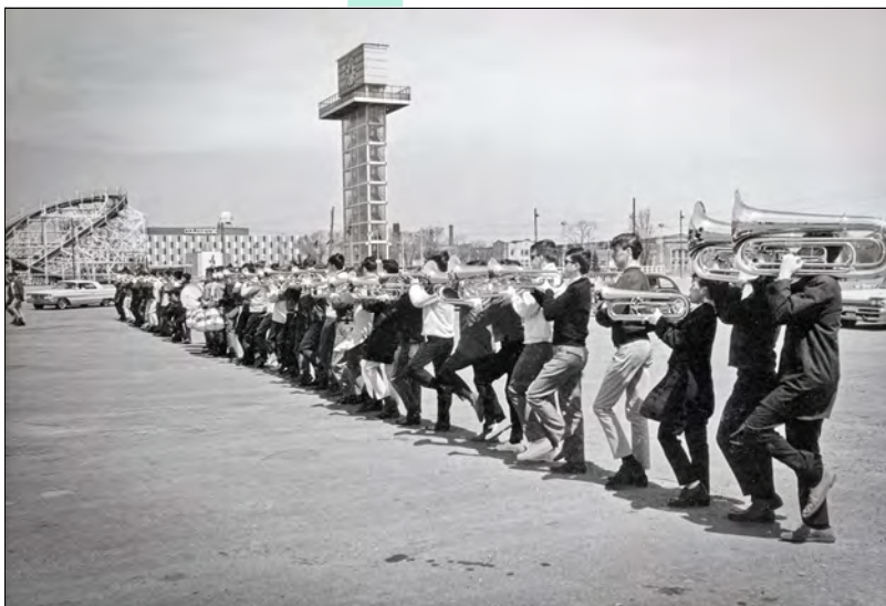
1967: Rehearsing at the "Shell" Tower (probably Bulova Tower then)

Let's get back to the Optimist Corps itself, which is what this