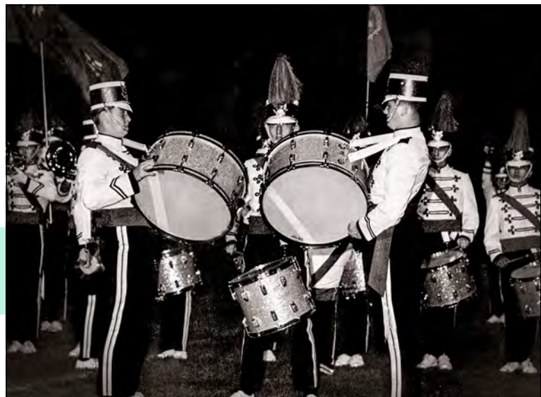
1966: De La Salle

Filling another gap in their armament, De La Salle decided to allow people into the Drum Corps who did not attend the school. This had to have been a hindrance to their development, even if minor. The Optimists had never had such a restriction, anybody being allowed to join if they had proper releases. By doing this, De La Salle had opened a door that was to contribute to the exciting events that lay in the future.