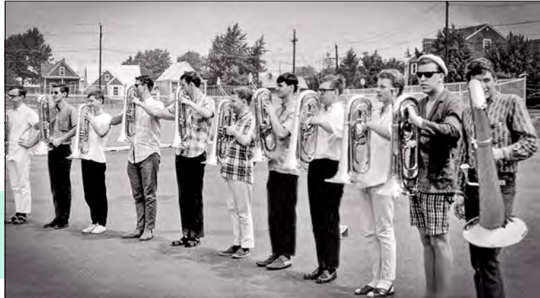
1967: Toronto Optimists at practise

For all the good reports about this year's Optimists, one of those amazing things that can happen from time to time happened on February 25th. At the Rochester, N.Y. "Sound Off" contest, the Optimists placed second. What made this unusual was that it was to a Canadian Corps. This was big news, and Les Metropolitains, of Montreal, Quebec, did it by six tenths of a point. As mentioned before, they were a Senior Corps.