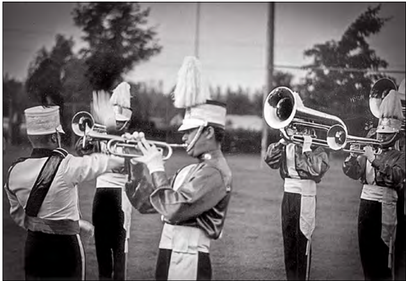
1967: Toronto Optimists (East York)

For the Optimists, of course, all these developments meant that next year could be even tougher than this one. Though they were still supreme in their own backyard, the days when that supremacy was easily maintained were long gone. Forever!