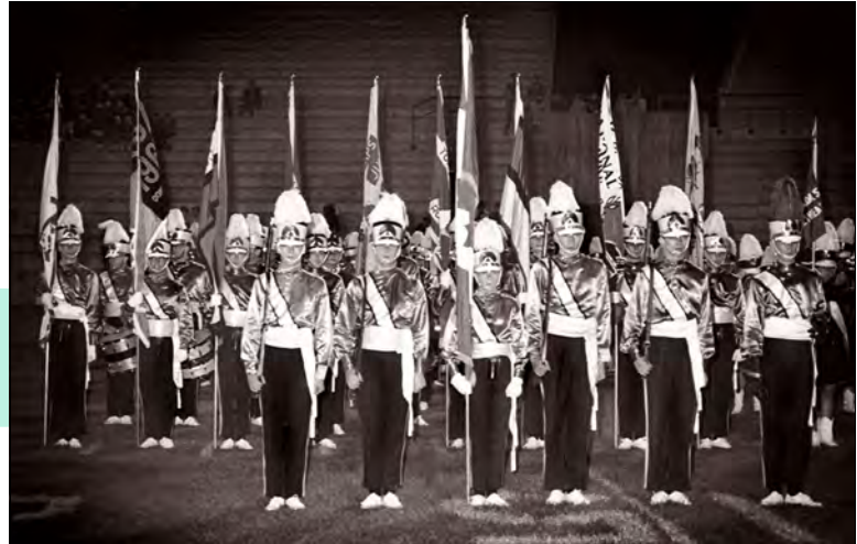
1966: Toronto Optimists on Retreat (Nationals, Montreal)

for third. Still in contention were York Lions and Sertomanaires, just tenths behind. There had never before been such a crush at the top of the junior division and it laid the basis for top-notch finals. Four Corps would be in it.