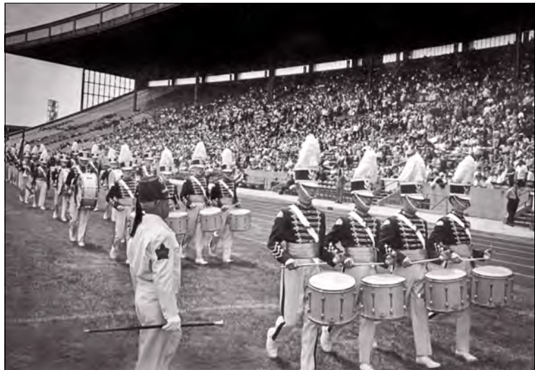
1967: Garfield Cadets (Shriners International)

Although the Optimists still took first with 83.91, second was La Salle with 82.31, then De La Salle with 79.15. They had gone from a seven point deficit to just over a point and a half in two weeks. What an unpredictable business this was.