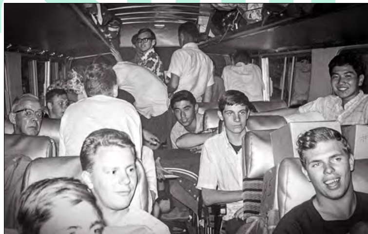
1967: Corps members on the bus

The march of events continued. In February. One of the categories won by the Optimists at the individuals had been that of bugle quartet. That was the Provincial Contest, and in March, at the National Contest, they won it again. They were now the best in the country.