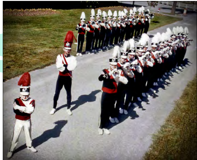
1966: Chessmen from St Catharines