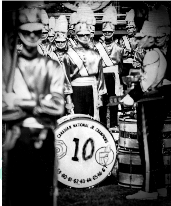
1967: Toronto Optimists with hand-written 10 (Nationals retreat, Ottawa)

Most importantly, they were still the number one Junior Corps in Canada, no matter how narrow the margin.