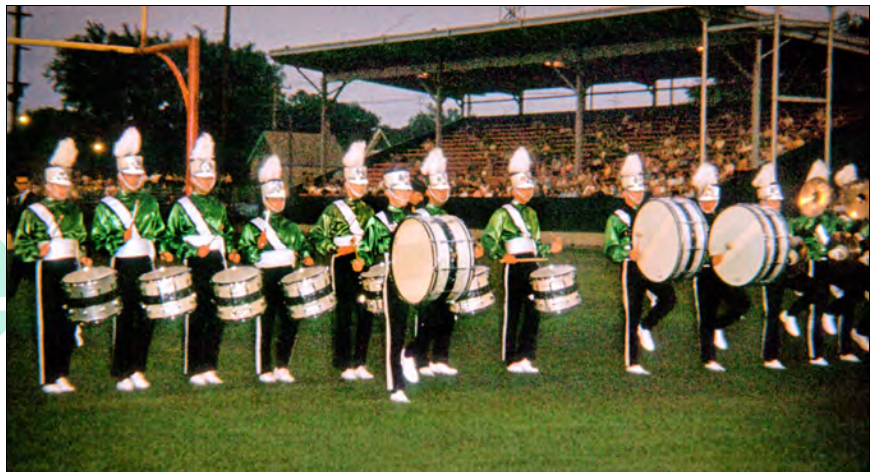
1967: Toronto Optimists (Sarnia)

The contest, to a small degree, did contain some surprises. A predictable outcome was the victory of the Boston Crusaders, who were now in the realm of "super" corpsdom. There was some disagreement though, with their four-point spread over the Chicago Cavaliers. Chicago was always good, seldom losing by such a margin.