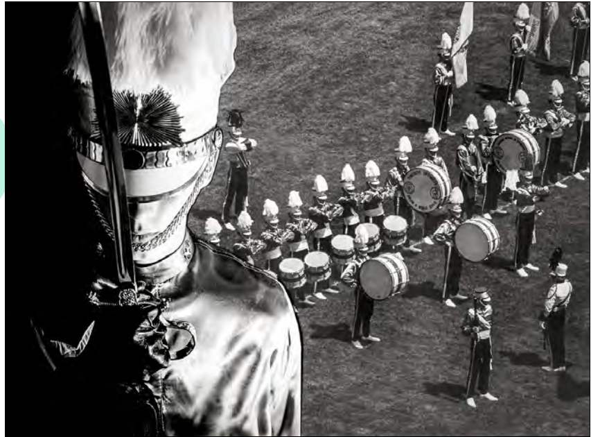
1967: Toronto Optimists Promo photo

The field show was shaping up nicely, at an early date. This was a good thing because there were more contests lined up this year than ever before in the history of the Corps. This was one factor that made it seem less of a hobby, leaning more toward a way of life. These schedules bore little resemblance to those of the early days, and it was either go along with it or fade away. In keeping with current trends, the Corps, as planned, was to be the largest one fielded yet with forty-two horns 13 , five tenors and four snare drums, with bass, rudimental bass drums, and two cymbals. The guard would field sixteen members. As noted before, the new numbers and instrumentation, all over, were changing the face of Drum Corps.