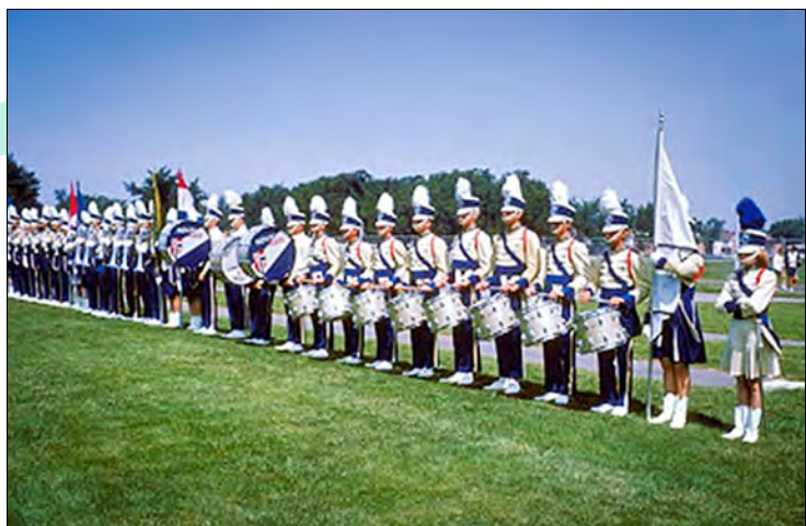
1965: Chicago Royal Airs

Another standout at this show was the size of the crowd, over 22,000, eclipsing the previous record.