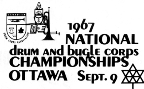
1967: La Salle Cadets advertise the Nationals in the Shriners program

The Cadets' repertoire is: A City of Brass; Johnny One Note; How The West Was Won; Brazil; Funiculi, Funicula and Softly As I Leave You..