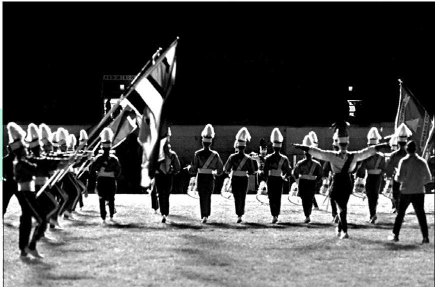
1967: Toronto Optimists Colour Presentation (Nationals, Ottawa)

As the time slipped away, towards the night show, tension rose. It was too late to make any effective changes, though in the past this had been done.