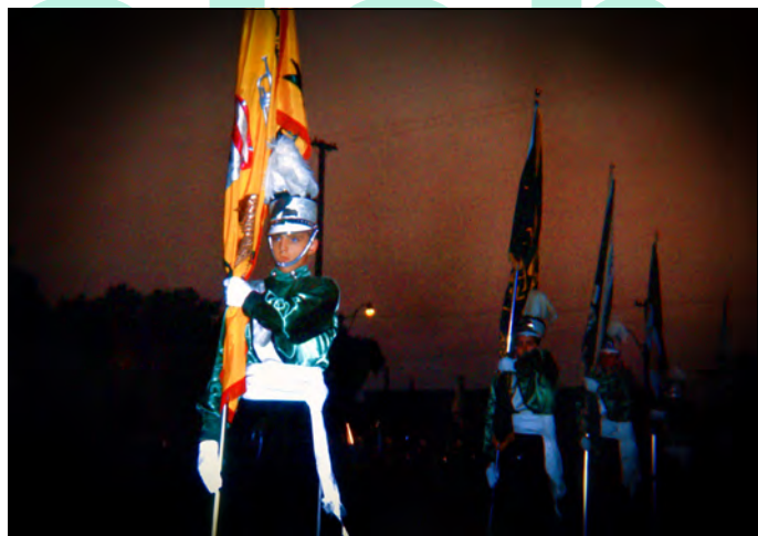
1967: Toronto Optimists guard member (Sarnia)