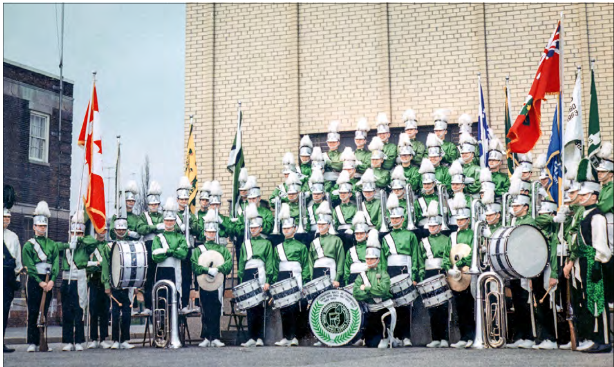
1966: Toronto Optimists Full Corps photo (by the Shrine Temple)