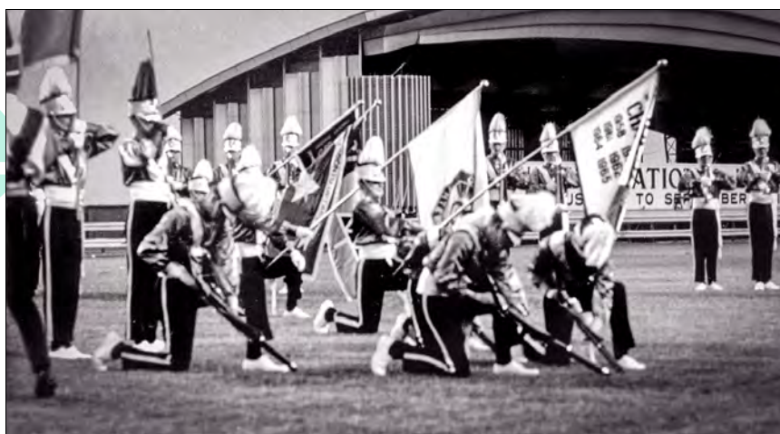
1967: Toronto Optimists Colour Presentation (CNE)

Not only had they maintained the winning streak over the Canadian Corps, but had opened it up to almost what it had been at the start of the season. Yet, only a week before, this gap had only been two and a half points, and earlier, at Sarnia, only half a point. To say that this business is unpredictable is an understatement.