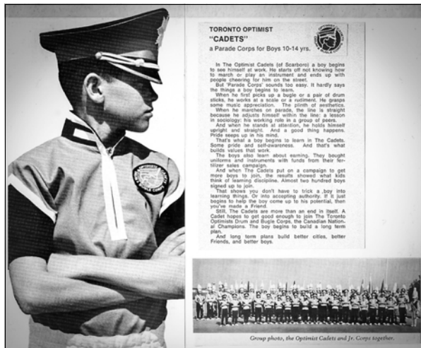
Optimists Cadets promo

Entering the scene this year, were two men who were to exert much influence on this Corps.